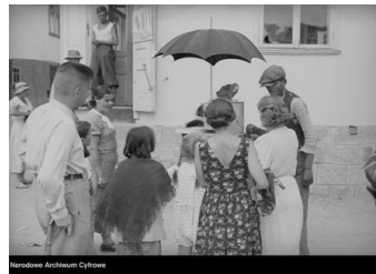
Fig.3. Photographer – Henryk Poddebski. On the market in Kosiv. Hucul region, 1936. NAC, Archiwum fotograficzne Henryka Poddębskiego. 3/131/0/-/455/58

The Hutsul Region is also represented on the NCA website by several photos in the album «National Minorities» (Mniejszości narodowe).